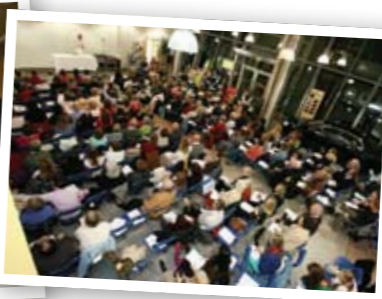
Celebrity chef Neven Maguire provided a great night with a cookery demonstration in our Volkswagen showroom.